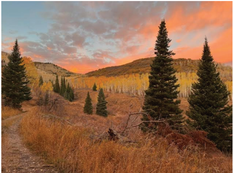
This Colorado trail is typical of most trails in the state, it is almost always uphill.