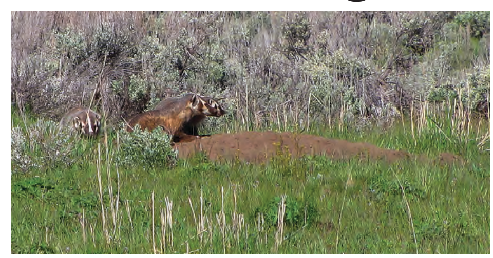
Badgers prefer open meadows and sagebrush plains for their homes. One North Rim ranger at Black Canyon saw one of these secretive creatures a couple of times late this summer.

They usually dig after their prey, but research shows that they team up with coyotes to catch their targets. The coyote might chase its quarry underground. The badger goes after it, forcing the first one out another hole for the coyote, but catches the other rodents that are still below ground.