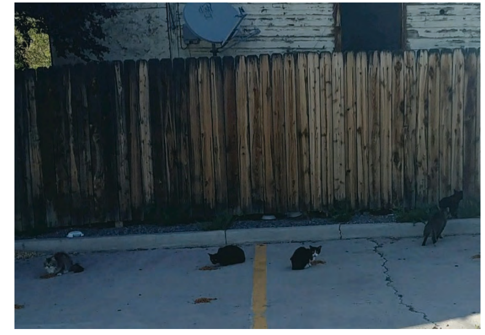
This colony of feral cats lives behind a business on South Townsend Avenue. They were very skittish and would not let me approach for a picture.

TNR programs show an effective rate with as little as a 55 percent neuter rate, while other studies show without neutering 100 percent of females success will not be attained. Many ecologists suggest that TNR is not effective at reducing, and ultimately, removing feral cat populations, especially if contact with owned cats cannot be prevented.