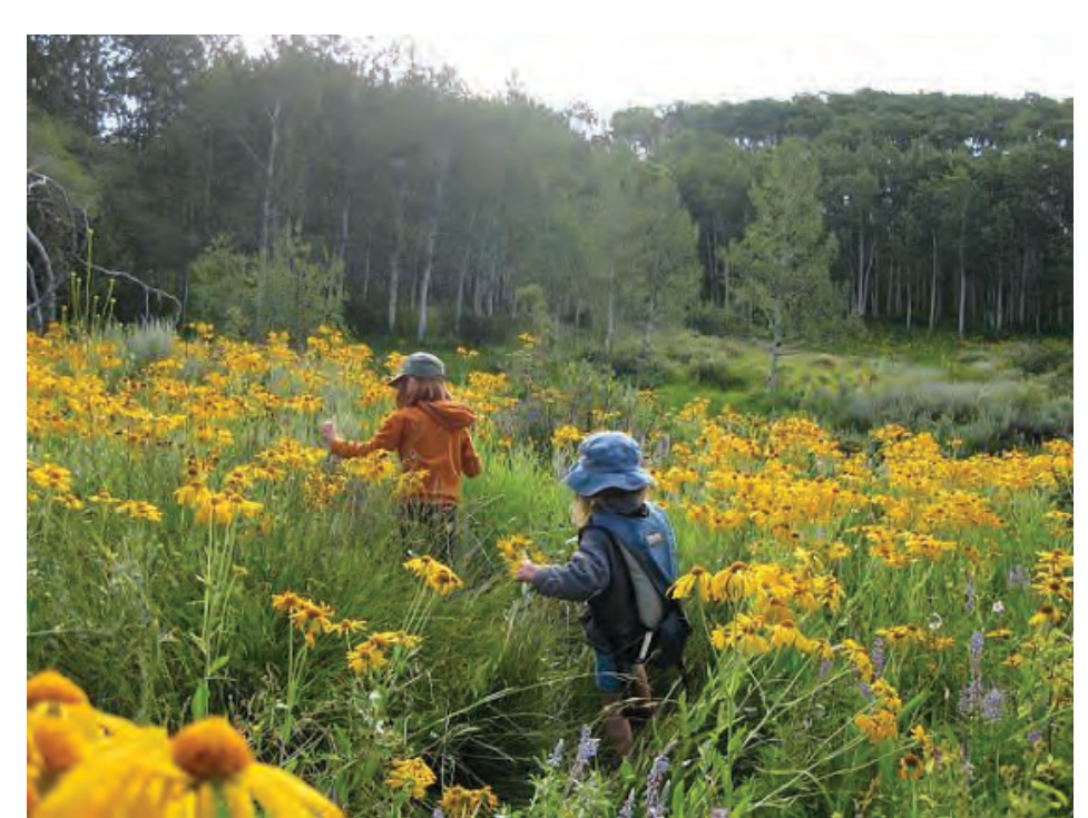
Kids playing in a sunflower meadow on the Grand Mesa National Forest

• A fistful of sounds: With a minute of silence and eyes closed, each person tallies all the sounds they hear using their fingers. After a minute, eyes open, and everyone sees who has heard the most sounds.