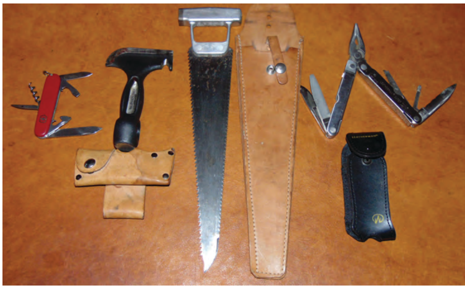
From left, Swiss Army knife, Skachet, Sportsman Saw and a Leatherman tool.