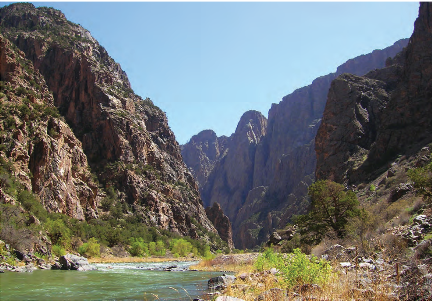
The Gunnison River floods and recedes through the seasons below the cliffs of Warner Point. Living rivers have much to offer us if we take the opportunity to put our feet into them.

fluctuated. Streams meandering through the meadows above the town of Gunnison warmed during the day. Those warmer waters didn’t reach the middle portions of Black Canyon until night. The thermal inversion was important as one of the fish species he found relied on that change. Kinnear recorded eight types of fish among the seven stations along the 14 miles of river. They varied from trout to suckers to dace. But in one location, he found the bonytail chub. An ancient species (goes back well before the carving of Black Canyon), little was known of this fish at the time, and only a little more is known today. They are predators who prefer to feed at night, growing to almost 2 feet in length. Considered an elegant swimmer (the Latin name for them is Gila elegans – “handsome in water”) they are a smaller fish competing