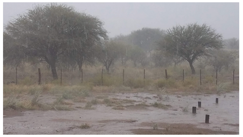
It does not take much rain to flood the ground when you have soil like ours here on the Western Slope.

rise, react as if a flash flood is occurring and don't "wait and see." A stream can rise several feet in just two minutes and by then, it is too late. Better safe to move than sorry you waited.