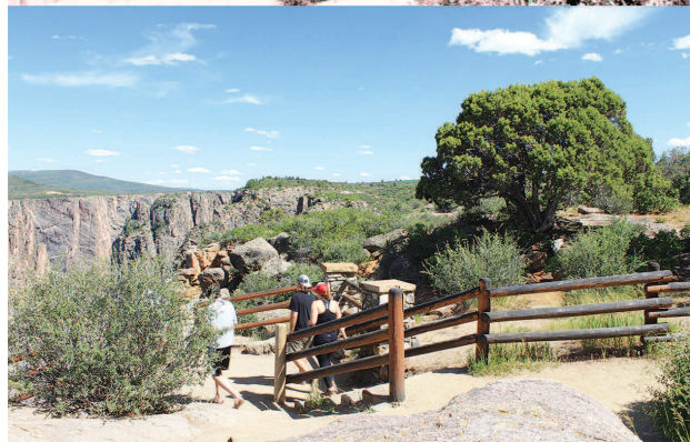
A juniper tree, upper right-hand corner, witnesses a group picture of Montrose residents celebrating the opening of the first road to the rim of Black Canyon, September 1930 (upper photo). The first railings were installed some 30 years later. Dubbed the Dedication Tree today, it watches over visitors at Chasm View on the South Rim.

specific rocky prominence in the canyon) provided a unity between human and hallowed spirit. But in the stillness, in that tranquility which can be found in grand landscapes, maybe it's enough to know that the pinyon and juniper trees continue to frame the transcendent while keeping silent for those who seek that peace.