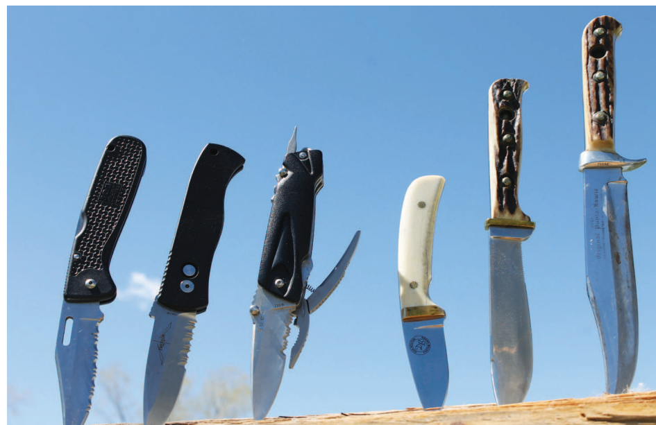
Pictured are a few pocketknives that would make good choices for a folder (first three on left) and fixed blade (three on right).